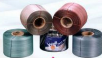
R.P. BOX STRAPS (WITHOUT-WHITE)